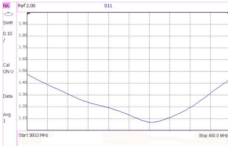
VSWR Vs FREQUENCY CHART

Note: All information contained in the datasheet is subject to change without any prior notice.